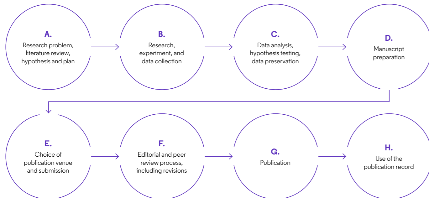
Figure 2. Critical stages to ensure integrity in research and publication: More dangers than fabrication, falsification, and plagiarism

In recent years, new and troubling behaviors have emerged at this juncture in the research and publication cycle. Unscrupulous authors, if asked to recommend reviewers, have suggested accomplices or have redirected a review to themselves using alias email addresses (Ferguson et al 2014, Haug 2015, Kulkarni 2016, Rivera 2019). Such fake, self-directed peer reviews highlight weaknesses in many publishers’ peer review systems. Once reviewers’ comments are received, authors should provide timely and focused revisions, without substantial